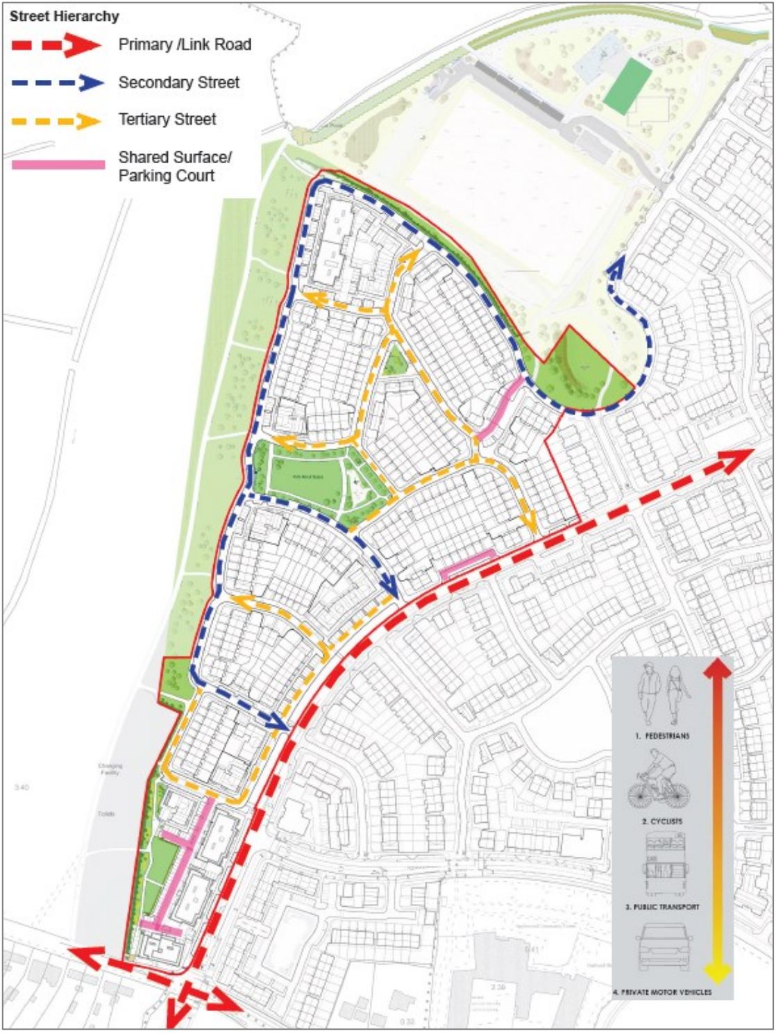
Figure 1. Proposed Connection within the Hierarchy of Street Network in the Scheme

In terms of arrangement of the foregoing connections, this is submitted to be in a clear hierarchy of primary, secondary and tertiary streets, all of which are connected, permeable and integrated with the existing urban development, the regional park and the wider area (see Figure below).